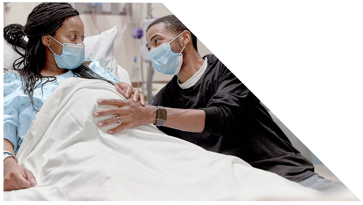
*Visitation guidelines and hospital-based tours and classes may be subject to change due to COVID-19.

We have several security measures in place to protect you and your baby. Our staff will review these measures with you upon admission.